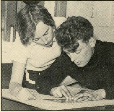
The couple plots their course at sea aboard the "Mermaid" (1936).