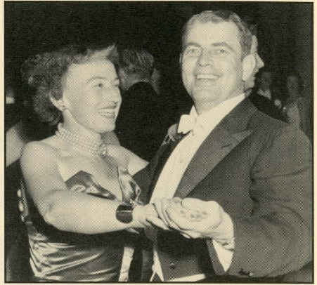
The San Francisco Cotillion (1953).