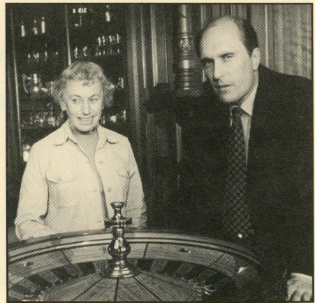
Filming at the Mansion with Robert Duvall (1973).