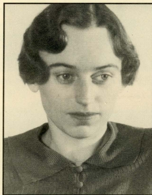
Teaching assistant in 1933.