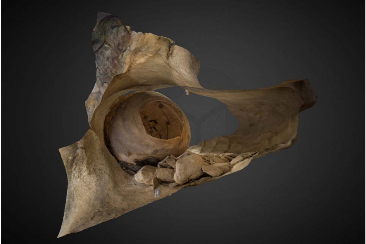
Figure 6. Cross-section of photogrammetry model.

groups such as the Chumash and the caves of the Santa Barbara backcountry may have provided a valuable storage facility.