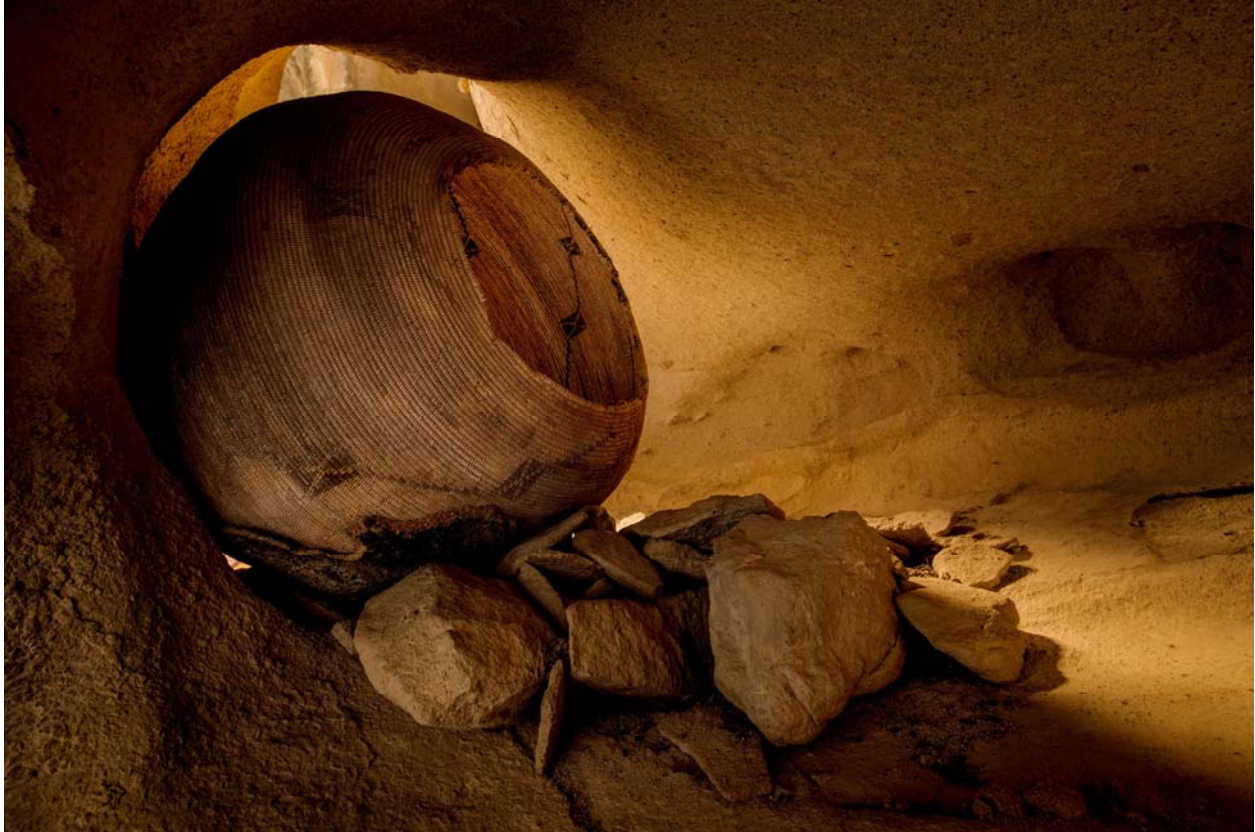
Figure 1. Bryne Cache in situ.