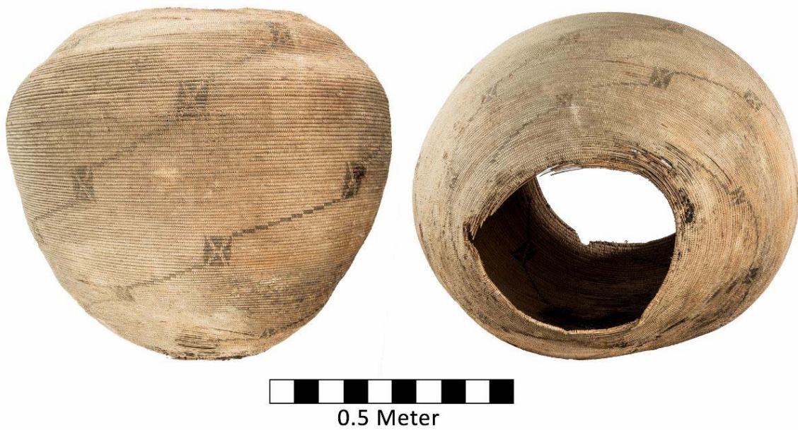
Figure 2. Storage Basket (x?im) (B1), sideview (left), looking through former base (right).