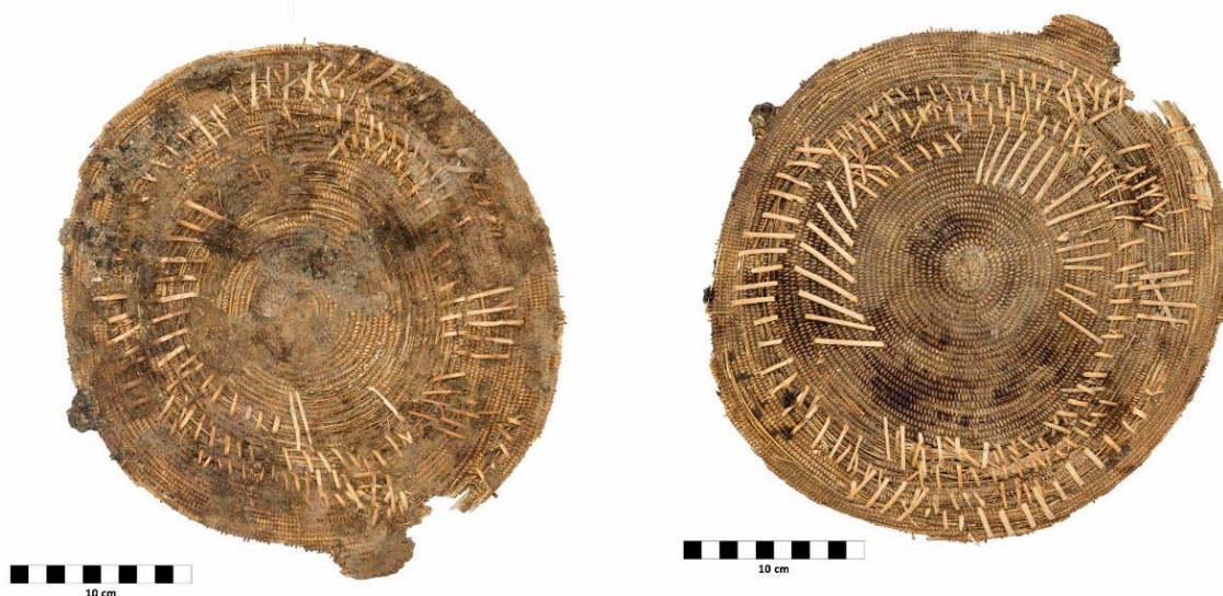
Figure 4. Heavily mended basket (B3), potential base of storage basket.

The parching tray (B2) measures 47 cm across and is more closely coiled (at 5-6 stiches per centimeter) than the storage basket. The surface appears to have been treated with asphaltum, which has left a thick, dark patina (Figure 3). The sewing material is difficult to identify due to heavy carbonization and good residue. It appears to potentially be sumac ( Rhus aromatica ), rather than Juncus textilis , but the identification is speculative. Likewise, the foundation is obscured heavily by use and patination, but appears to be a deer grass ( Muhlenbergia rigens ) foundation. The convex surface utilized intentional split stitches, while the base, and repairs to the base, utilized non-interlocking stitching at 3.5 coils per centimeter. Approximately 35 percent of the parching surface is missing, with gnaw marks from rodents evident. The original rim coil of the parching tray was also absent, but the outermost remaining coil shows polish that suggests it served as the rim for some time after the original rim coil was lost, prior to caching.