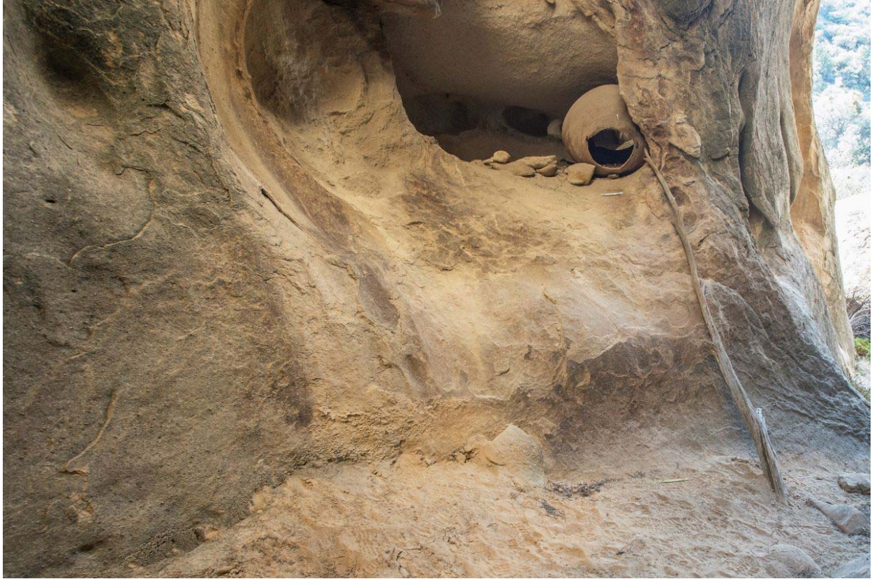
Figure 5. Bryne Cache in situ with cave stick.

and location within the storage basket suggests it likely served as the storage basket base, a repair after the initial base was lost. It is not evident whether the basket was intentionally made to serve as a base for the storage basket (B1), or, whether the basket was repurposed as the base after being damaged.