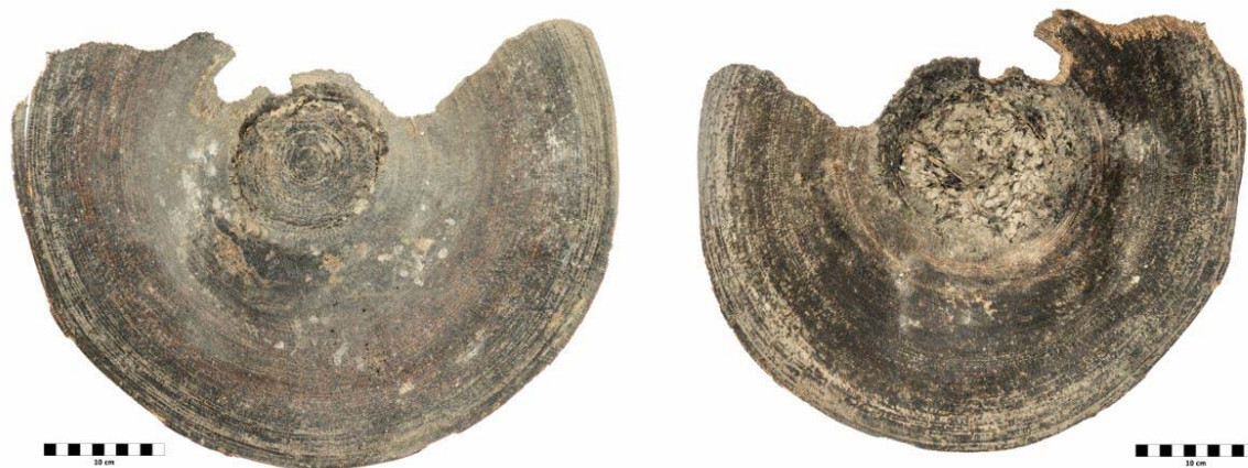
Figure 3. Parching Tray (B2), working surface on left.