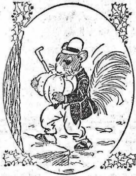
Busy the Rest of the Morning.

Mr. and Mrs. Squirrel were busy the rest of the morning taking them home. And they asked the Chatter-Iteds to join them and fill up their larder, too! So every one had a Merry Christmas and Mrs. Squirrel did not have to put both hands in her apron pockets for months and months!