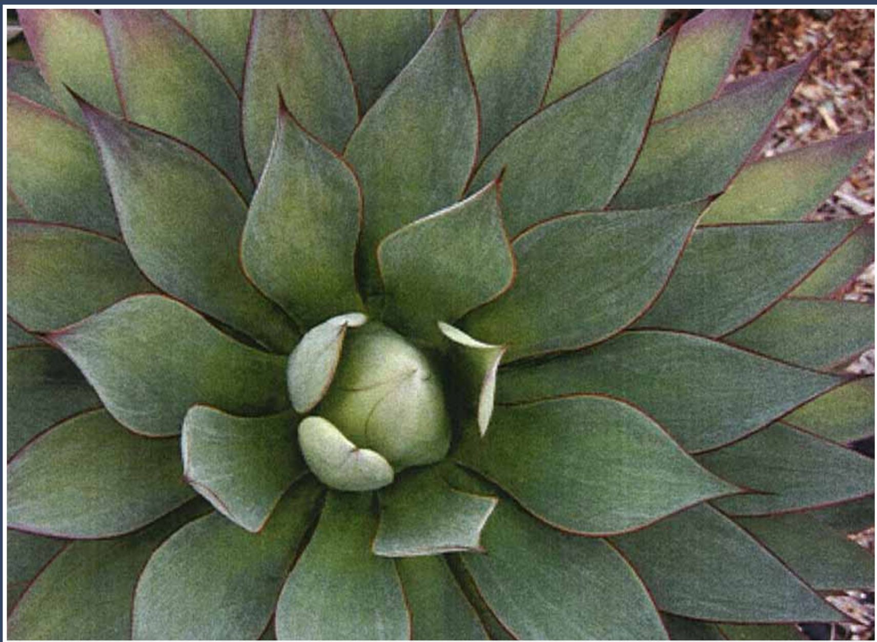
Red Margin Agave