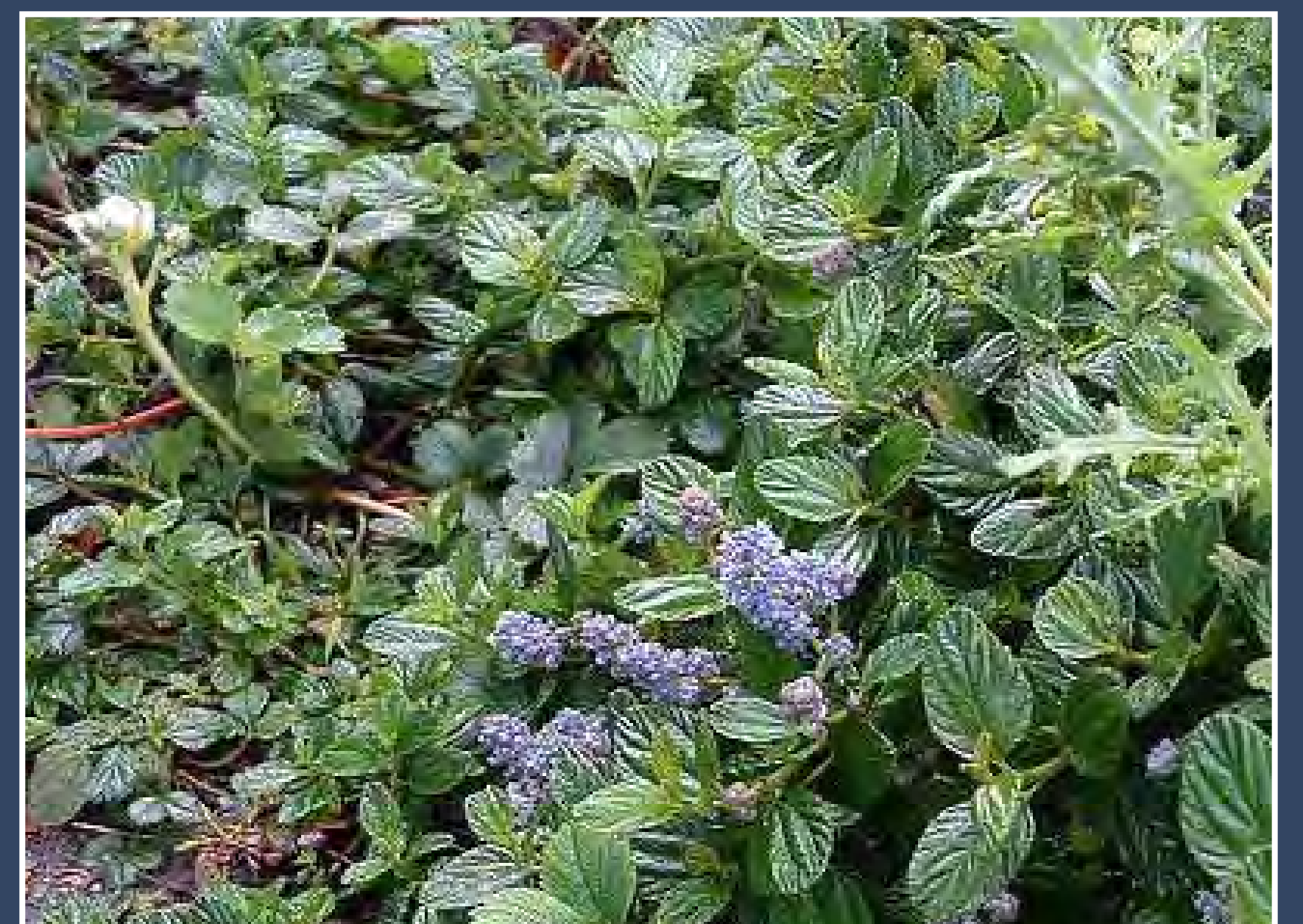
Yankee Point Ceanothus