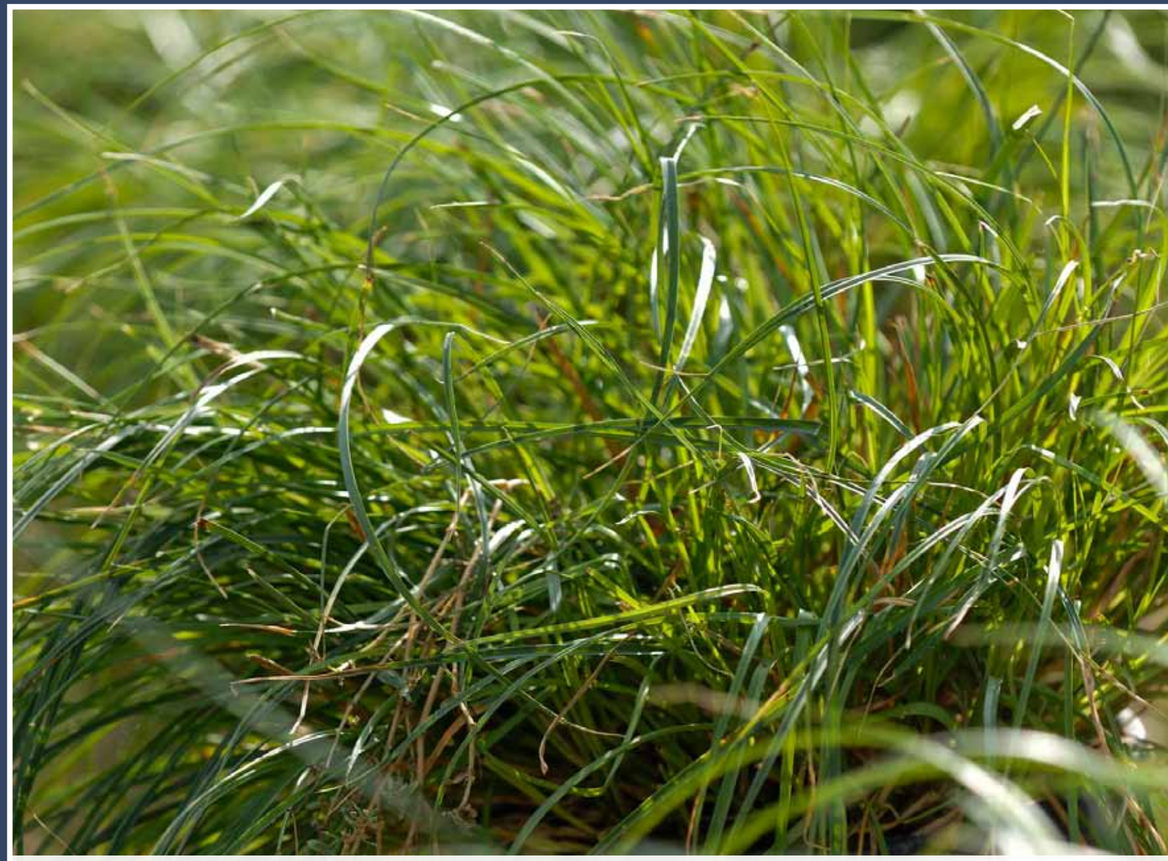
California Native Sedge