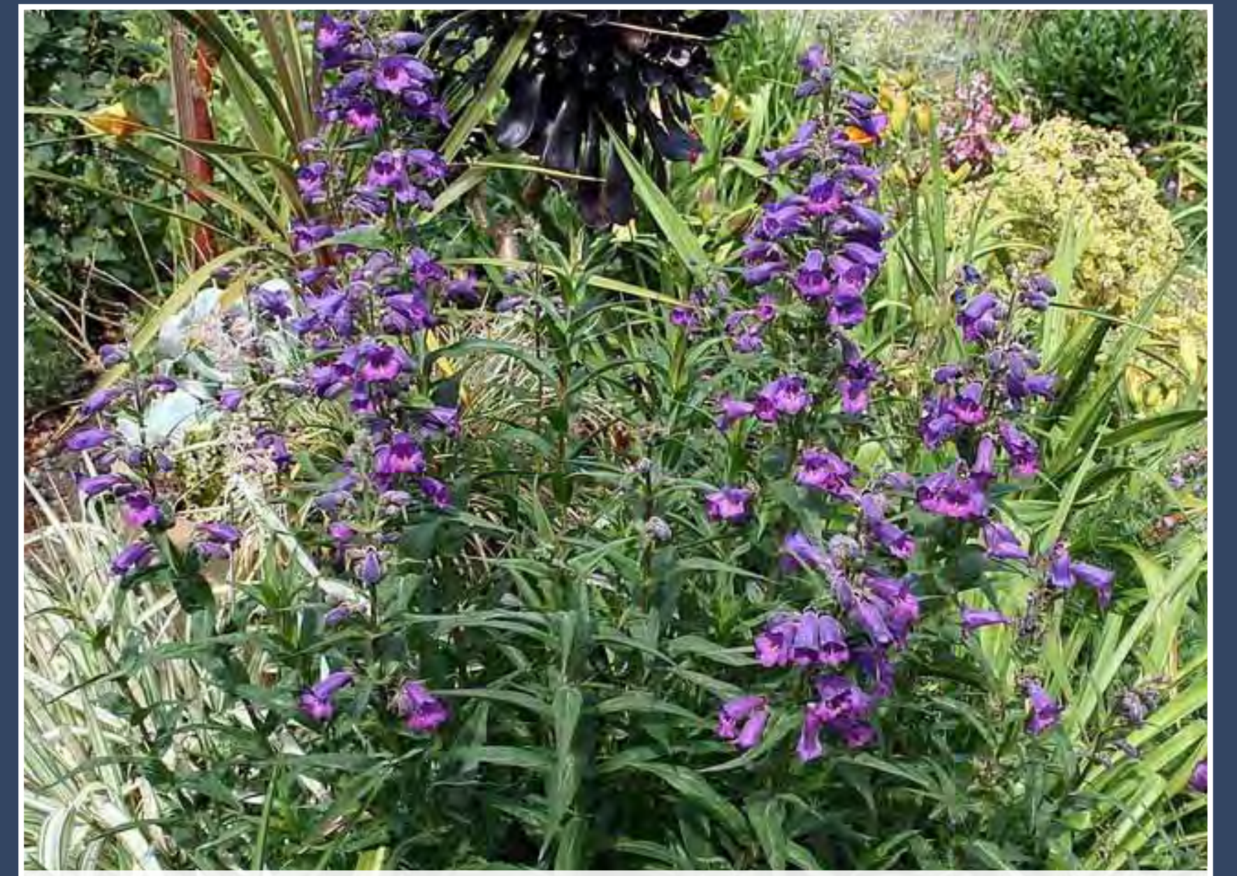
Midnight Blue Penstemon